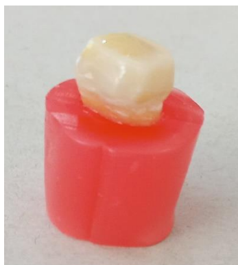
Figure 2. cementation of composite resin on the samples The samples were stored in water for a period of 3 months (20). Each sample was then sectioned

process. Excess cement was carefully removed using a microbrush. Curing was then performed for 40 seconds from each of the buccal, lingual, and occlusal directions. Finally, the margins of the restorations were carefully polished using Diacomp Plus Twist (EVE, Germany), and glycerin gel was applied before curing for an additional 20 seconds (Figure 2)