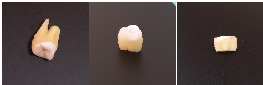
Figure 1. Preparation and initial cutting of samples

Optibond FL is a fourth-generation adhesive system (etch-and-rinse, 3-step). In the first step, a 32% phosphoric acid was applied to the enamel and dentin for 15 seconds (starting with enamel and ending with dentin), then rinsed for 15 seconds and dried for 3 seconds. The second step involved applying the primer for 15 seconds, followed by air-drying for 5 seconds. The final step consisted of applying the bonding agent for 15 seconds, air-drying for 3 seconds, and curing for 20 seconds.