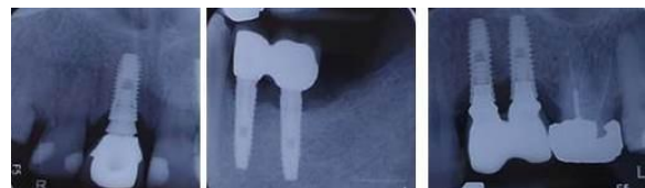
Figure 1. Parallel digital periapical image of a patient with symptoms of peri-implantitis showing bone resorption

After obtaining informed consent from the patients, digital periapical radiographs were taken using intraoral sensor number 2 with parallel technique (dental x-ray phosphor plate scanner soredex optime). The amount of bone loss in millimetres based on the connection location of the abutment and the implant fixture was checked using a computerized measurement system (Scanora software, version 3) (Figure 1). Based on the amount of vertical bone loss, the implant was divided into three categories: vertical bone loss less than 1.5 mm, between 1.5 and 3 mm, and more than 3 mm.