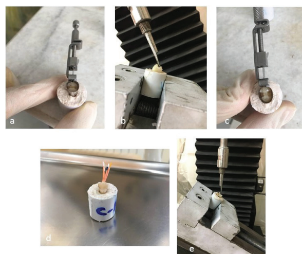
Figure 1. a) Prepared tooth ready for restoration b) Tooth under load c) ribbon fiber placement d) RCT-Obturation e) Tooth fracture at the end of test

To restore the teeth, gutta-percha was removed from the pulp chamber at a level 2 mm from the canal orifice. All glass-filled areas were treated with 20% polyacrylic acid as a cavity conditioner for ten seconds. Then Fuji II LC Gold type glass ionomer cement (GC-Japan) was placed on the gutta-percha as a MOD restorer (20) (Figure 1a).