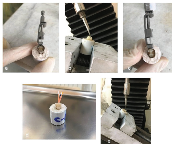
Figure 1. a) Prepared tooth ready for restoration b) Tooth under load c) ribbon fiber placement d) RCT-Obturation e) Tooth fracture at the end of test

To restore the teeth, gutta-percha was removed from the pulp chamber at a level 2 mm from the canal orifice. All glass-filled areas were treated with 20% polyacrylic acid as a cavity conditioner for ten seconds. Then Fuji II LC Gold type glass ionomer cement (GC-Japan) was placed on the gutta-percha as a MOD restorer (20) (Figure 1a).